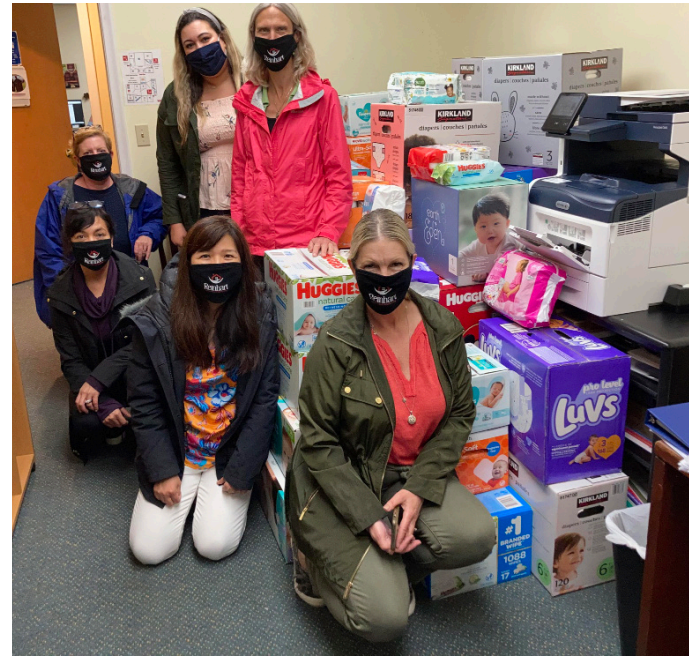
Charles Reinhart Company Realtors donate diapers for the new diaper pantry